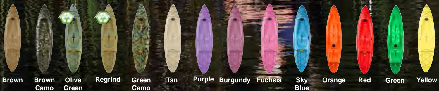
Brown Brown Camo Olive Green Regrind Green Camo Tan Purple Burgundy Fuchsia Sky Blue Orange Red Green Yellow

All colors are in granite and available on all models There are fourteen colors to choose from